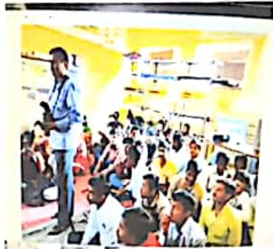
Students present street theater performance