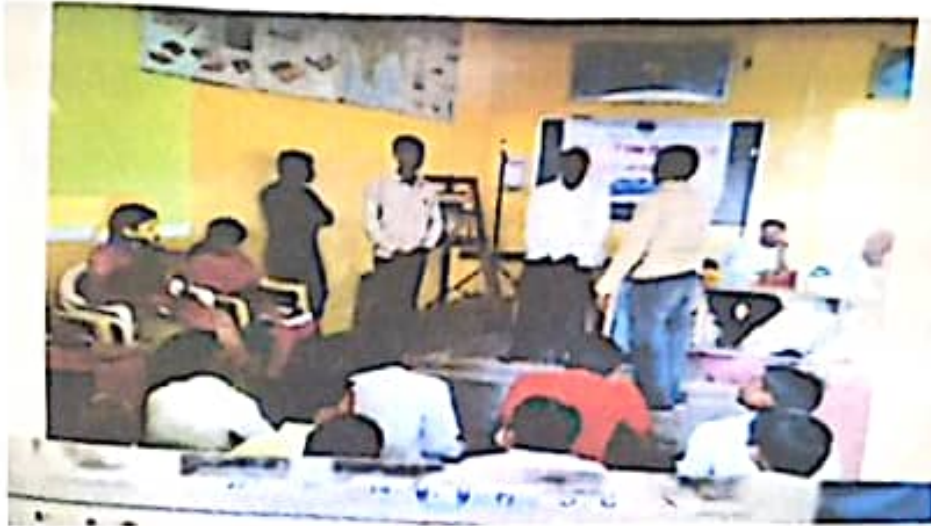
Students performing Jalansh street play