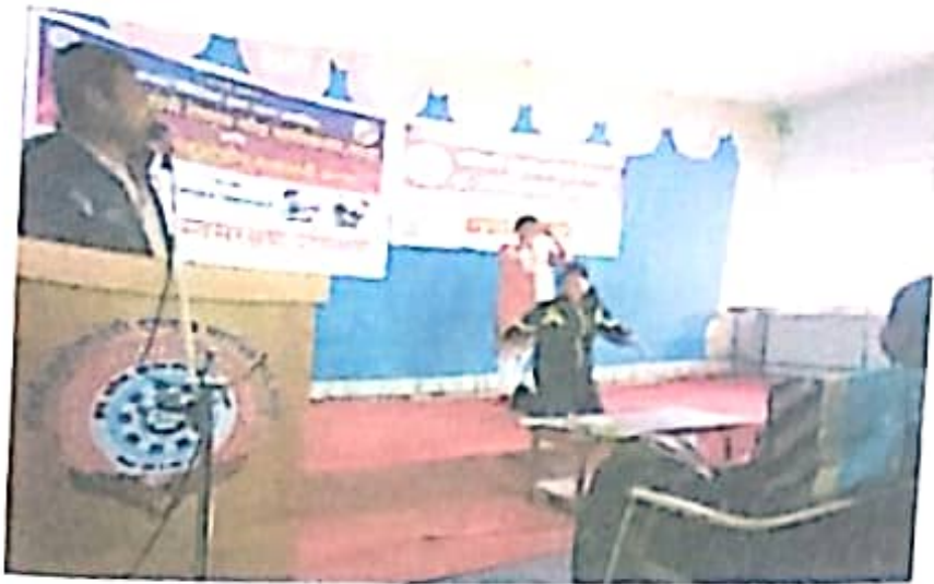
Practicals of Self defence by two BSM student