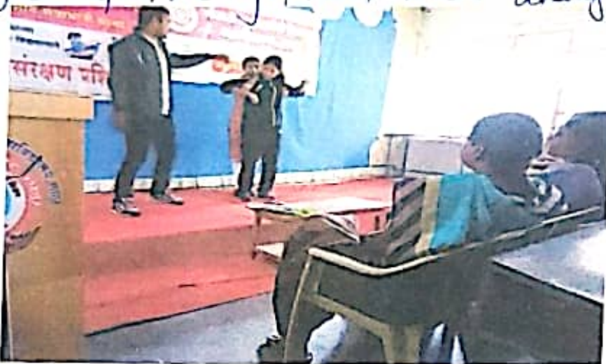
Trainer giving the practicals to the students.

[Signature] ICAC Coordinator Smt. Sushiladevi Deshmukh Senior College, Latur