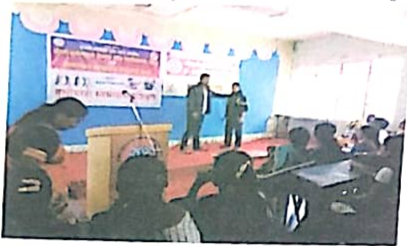
Trained while giving the lessons of self defence