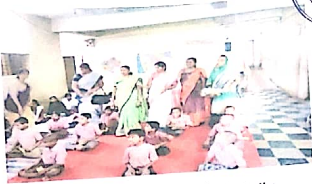
Fruits were distributed to the students on the occasion of Savitribai Phule Jayanti